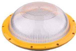
Clear striped spherical glass